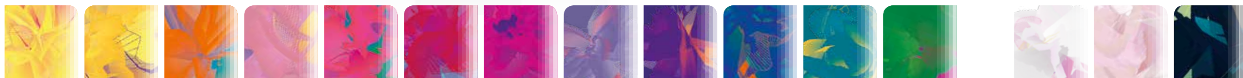
Future Yellow Uber Gold Infinite Orange Nu-Dist Pink Hyper Coral Next Red High Magenta Pure Violet Ultra Purple New Blue Super Petrol Neverseen Green Tomorrow Clear Vintage Blush Tonight Dusk